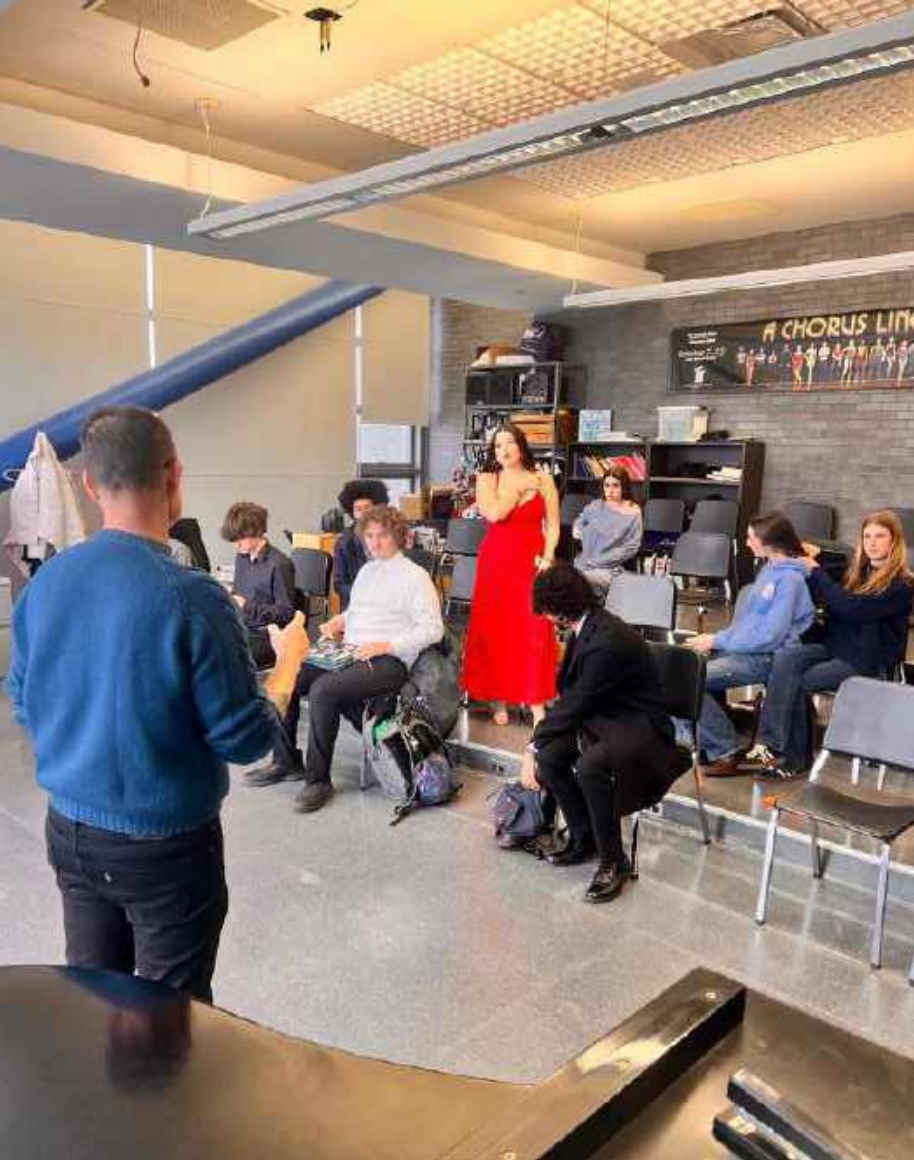
Left — Audition workshop at the Frank Sinatra School of the Arts, March 2025