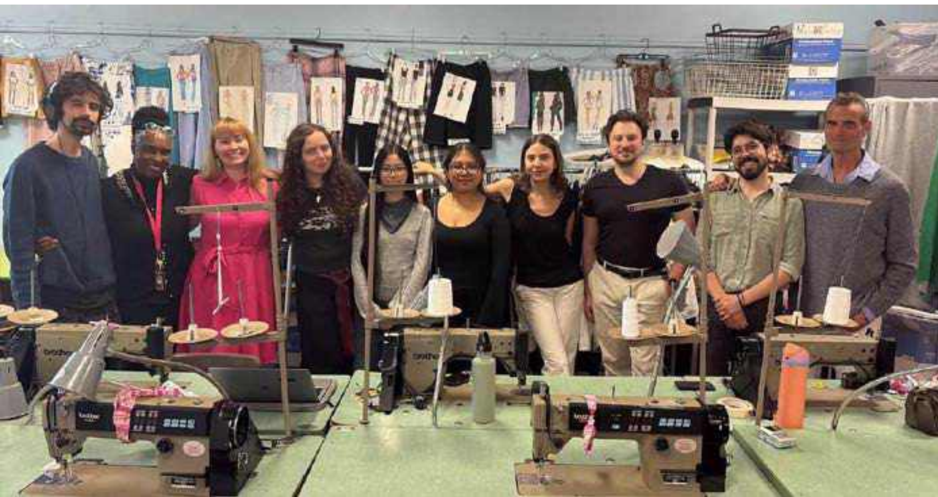
Below — Costuming workshop at the High School for Fashion Industries, Spring 2025