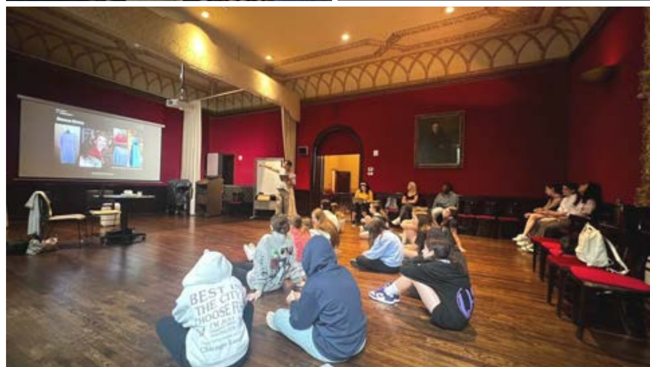
Below — Don Giovanni at the Dominican Academy, June 2023