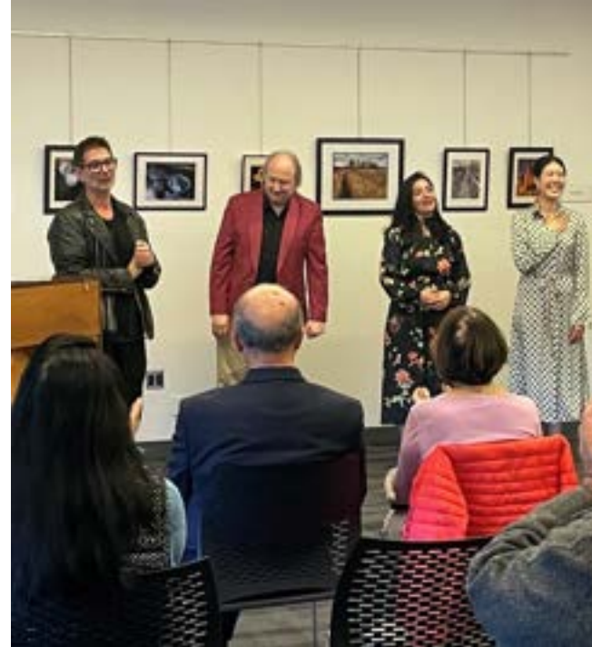
Left — 10 Faces Of Maria Callas, October 2023

It explores the intersections between opera, visual art, and education. The program consists of a warm-up session on the creative process of an opera and full-scale opera performances. Teatro Grattacielo also offers scholarships to students who write the best essays connected to Creative Tableaux.