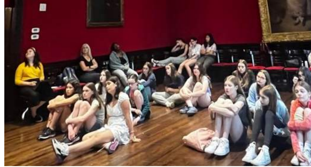
Up — Attentive students at the Dominican Academy Right — A full audience of 800 kids discovering about opera Below — Our production of Carmen only for the kids

We presented PART ONE of Creative Tableaux at the Dominican Academy in NYC in June 2023. This interactive session was filled with engaging Q&As, captivating projections, and hands-on set/costume workshops.