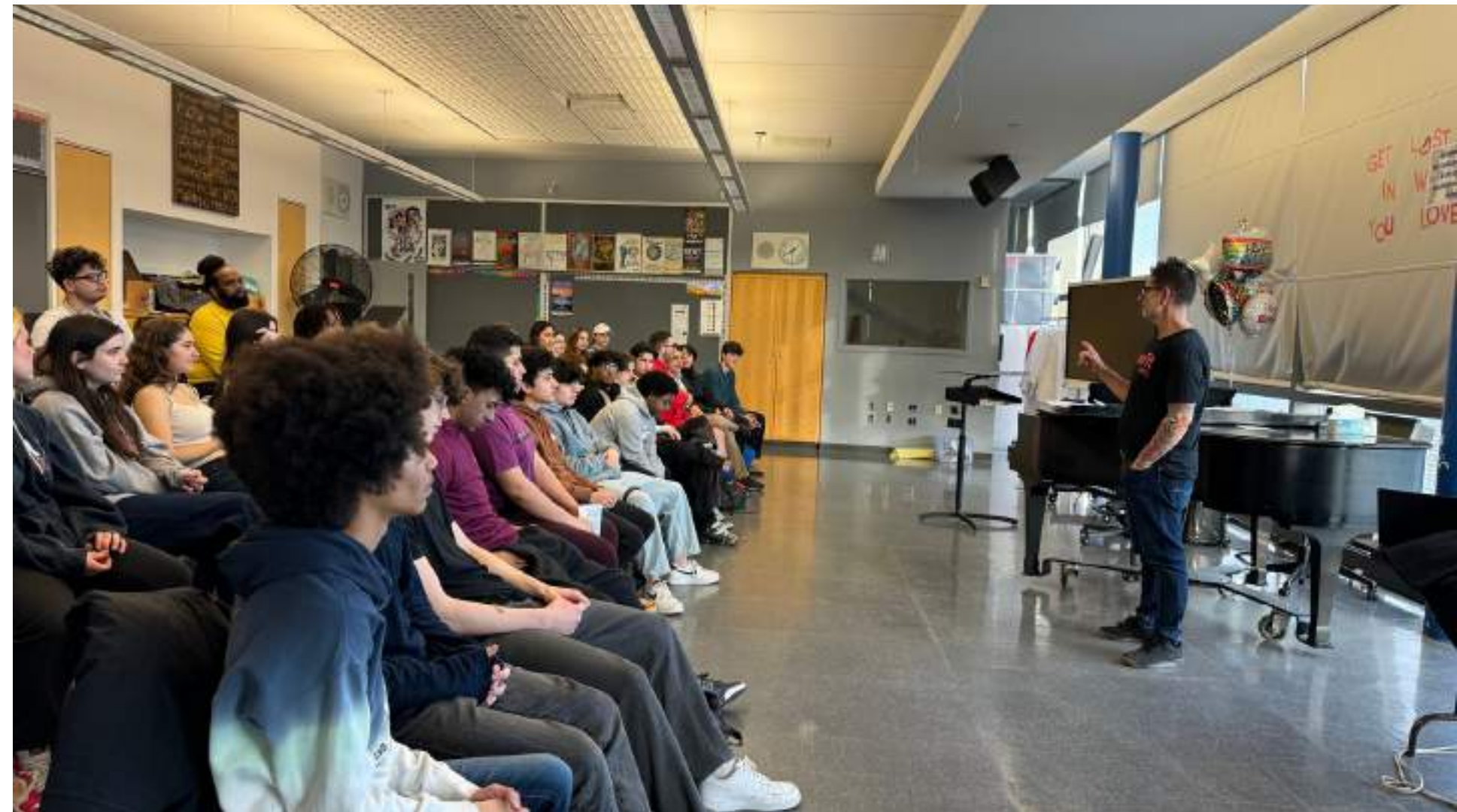
Below — Creative workshop at the Frank Sinatra School of the Arts High School, March 2024